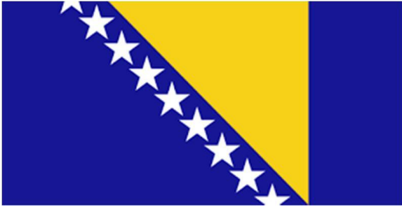
BOSNIA AND HERZEGOVINA